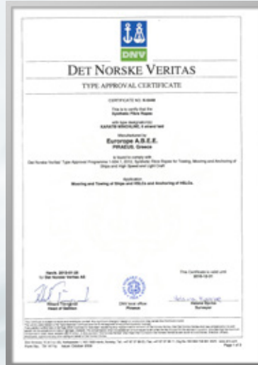
DNV Type Approval Certificate KARAT® WINCHline