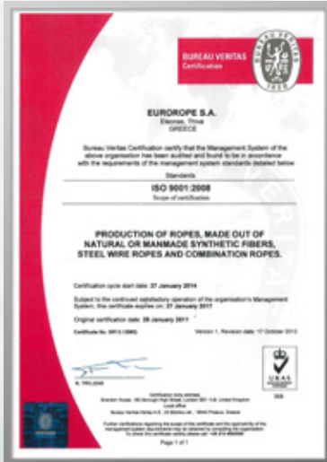
EuroRope Marine is certified according to NS-EN ISO 9001:2008