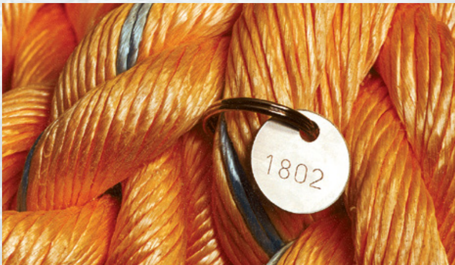
The ID number on the stainless tag corresponds with the last four or five digits of the certificate number.

The ID-tag is located in the splice of the mooring rope or tail (one ID-tag per eye splice) and with the EuroRope Marine's ID-marking system, keeping record of rope performance and age will be an easy task.